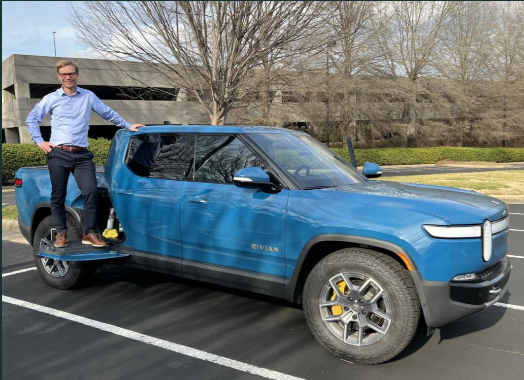
Rivian R1T – Electric pickup